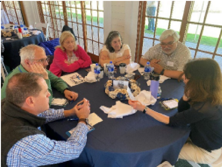
MRC Volunteers and Emergency Management Staff crafting an emergency training message